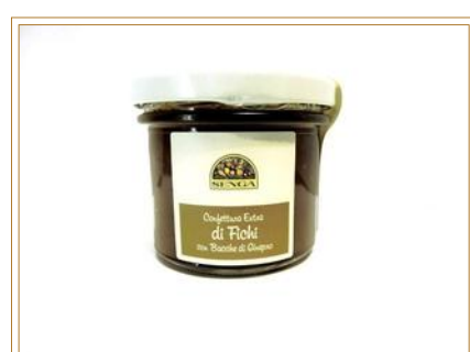
FIG JAM WITH JUNIPER BERRIES

jar 120 gr Shelf life: 730 days REGION: Lombardy