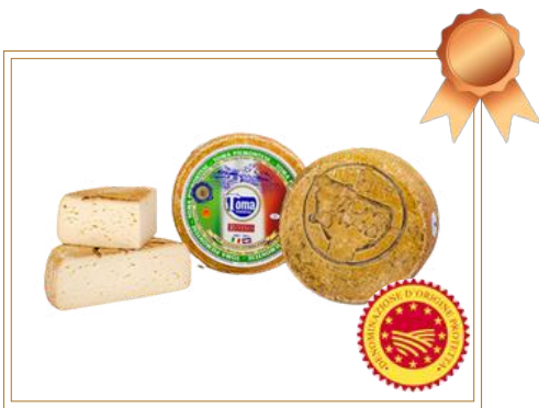
PDO RAW MILK TOMA PIEMONTESE